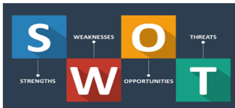
Fig. 1. Strengths, weaknesses, opportunities, and threats (SWOT) analysis

SWOT is a fundamental analytical tool in strategic management. SWOT gives a structured but flexible analytical framework for analyzing internal factors (strengths and weaknesses) and external factors (opportunities and threats) affecting an organization's performance and strategic position (Figure 1). SWOT differs from other analytical models or frameworks that are generally technical and data-based, such as Porter's Five Forces Analysis and several needs-based segmentation formulas. SWOT is a tool available to organizations of all kinds, regardless of size, age, or industry. It is a tool that can be used for every type of organization - startups seeking a direction, multinational corporations updating daily, operational, and long-term strategies, and even non-profit organizations trying to identify social impact [2].