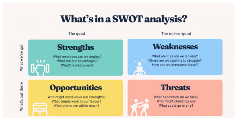
Fig. 2. The four components of SWOT analysis

Fundamentally, SWOT analysis allows organizations to analyze their internal environment (strengths and weaknesses) and external environment (opportunities and threats), empowering them to pursue strategies that maximize their strengths, overcome weaknesses, take advantage of opportunities, and minimize threats (Figure 2).